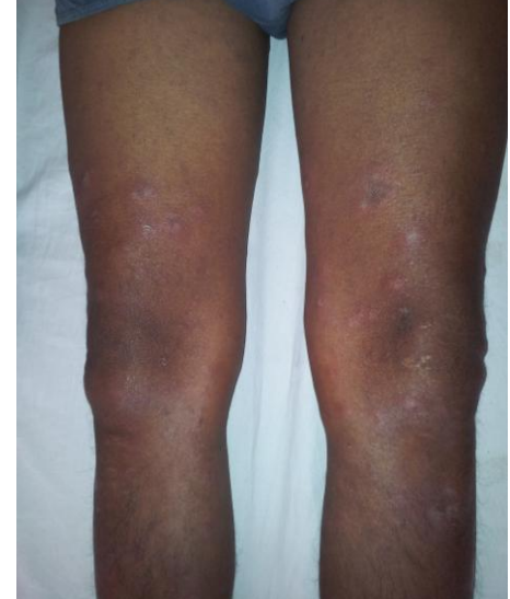
Fig: Multiple erythematous,tender nodules called erythema nodosum leprosum