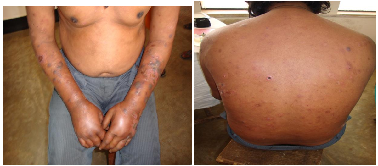
Fig: Patient with type II reaction having Erythema necroticans ulcerans showing grayish-black central necrotic areas on erythematous nodules which ulcerate and acral oedema.