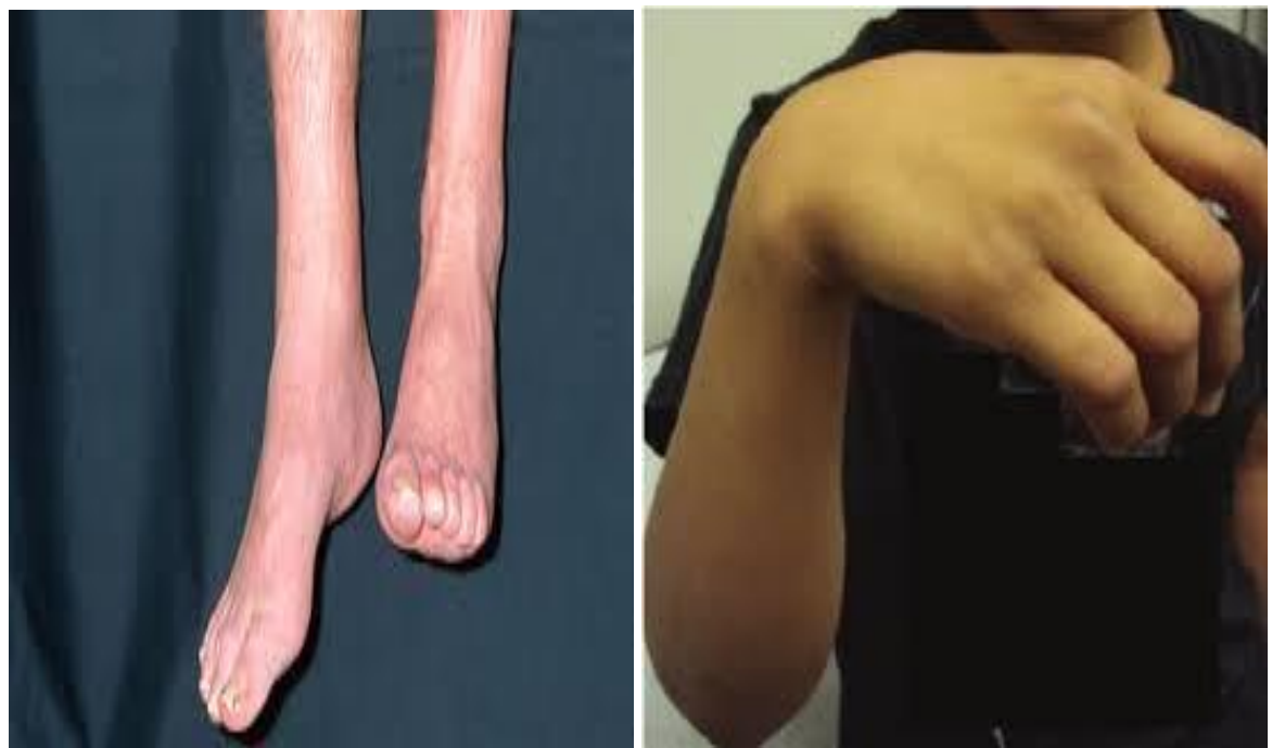
Fig: Foot drop